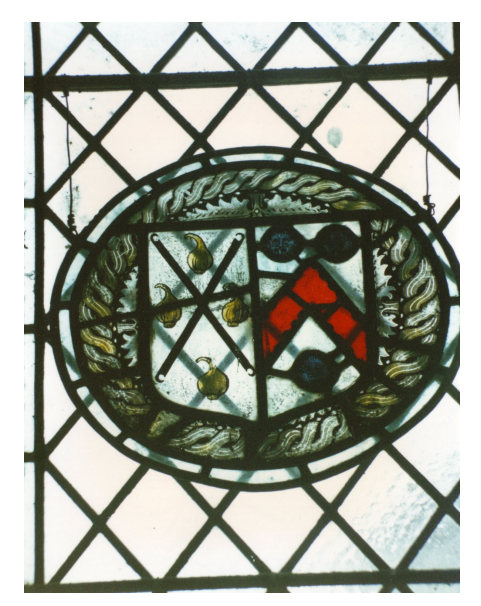
Dolton church.

It can be seen in the stained glass window at Iddesleigh church and in the carved pew ends at both Dolton and Dowland churches . . .