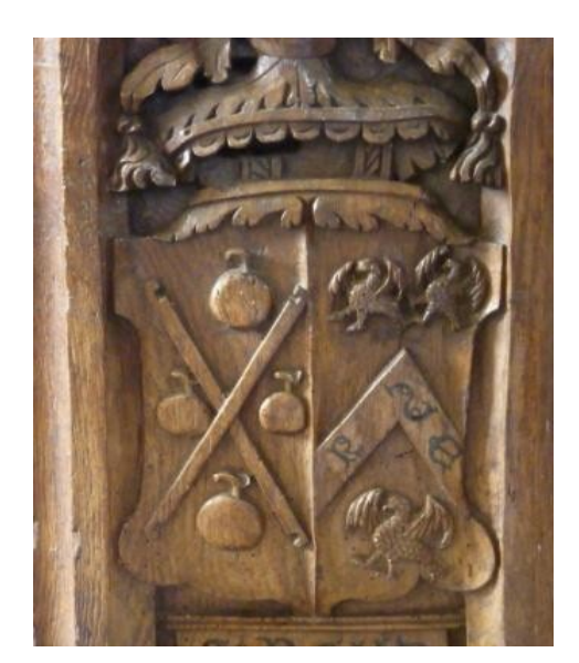
Pew ends at Dowland church.

Whilst it is clear is that the name Broadwoodkelly did derive from the name Cailli, Keilli, this may not have been from the Kelly family of Kelly as historians have supposed, but from the Kelloway/Kaylway family. The evidence is for this is all around us. We do not have the Kelly of Kelly family monuments in our local churches, but we do have the Cailli, keilli, Kayleway, Kelloway family monuments. We do have local fields named after them and we find them in the ancient tax records. It is a sobering thought that if it had not been for the corruption of names which I described at the beginning of this article, Moistown may have been situated in – and we may have all been living in Broadwoodkelloway. . . .